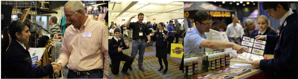
Exhibit & Career Expo

Businesses, organizations and universities have a unique opportunity to interact with the approximately 12,000 members and guests with more than 100 exhibitors sharing their goods and services.